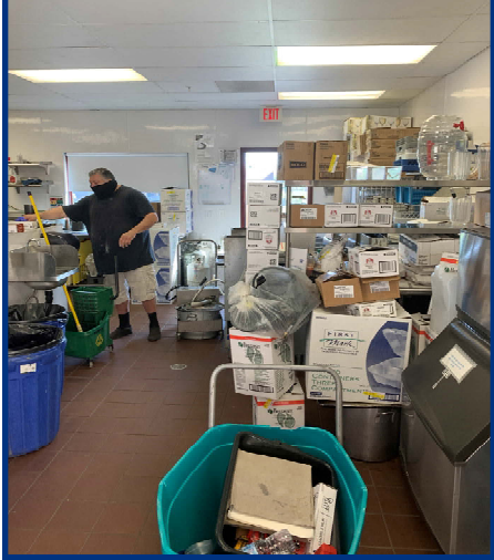
Supplies and set up for fish fry