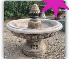
Fountain includes pump and delivery to your home!