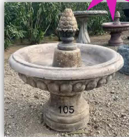
Fountain includes pump and delivery to your home!