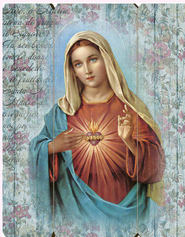
Immaculate Heart of Mary Feast Day – June 12