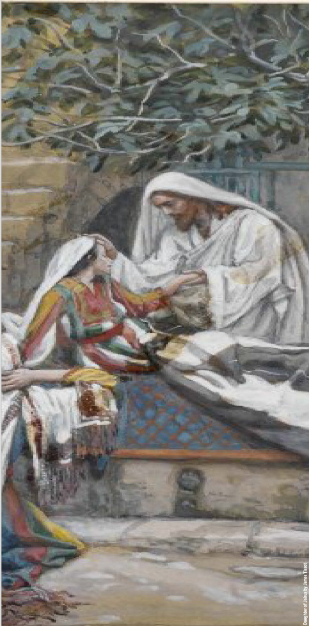
Daughter of Jairus by James Tissot

PRAY Do you ever offer to pray for someone and then completely forget? Try writing each person’s name on a Post-it and placing it on your bedside table. Other ideas: Pray the Rosary while driving or exercising, devoting a decade to each person; include prayers for others when you say Grace before meals; as soon as you offer to pray for someone, drop everything and do it!