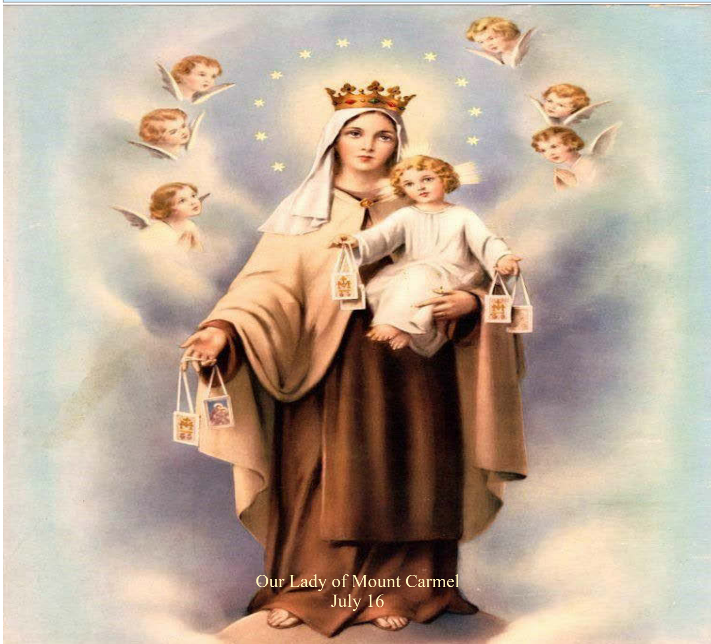
Our Lady of Mount Carmel July 16

FIFTEENTH SUNDAY IN ORDINARY TIME — JULY 11, 2021