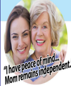
"I have peace of mind... Mom remains independent."

Safe-Guarding America's Seniors Nationwide!