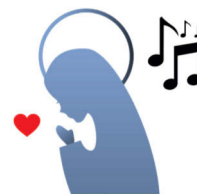
Immaculate Heart of Mary Children's Choir Brentwood, CA