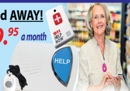
This Button SAVES Lives! As Shown GPS, Lowest Price Guaranteed!