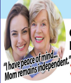
"I have peace of mind... Mom remains independent."

Safe-Guarding America's Seniors Nationwide!