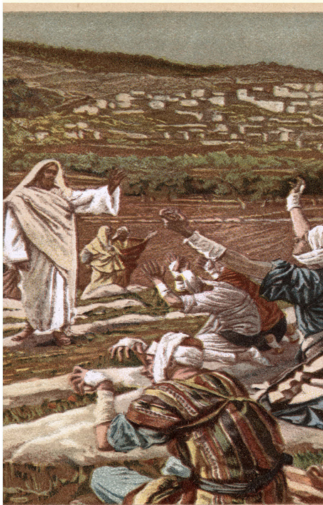
of the ten Lepers.

PRAY We quickly turn to God when things go wrong. Next time something good happens, turn to God with the same urgency and say a prayer of thanks.