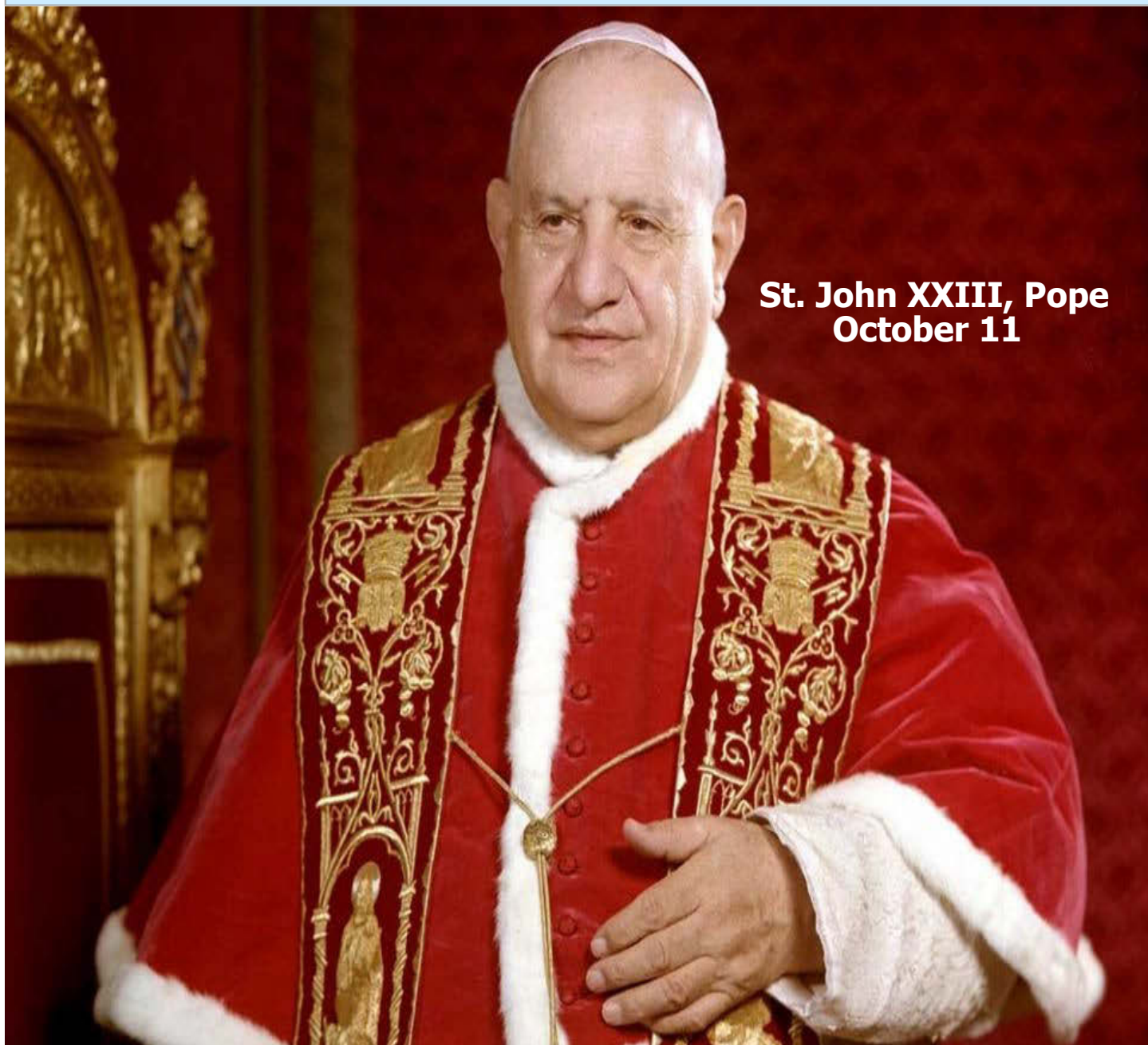
St. John XXIII, Pope October 11

TWENTY- EIGHTH SUNDAY IN ORDINARY TIME — OCTOBER 10 , 2021