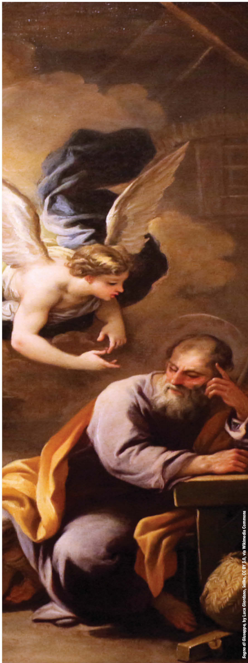
Signs of Giuseppe by Luca Giordano, 1670

ACTION "Behold, the virgin shall conceive and bear a son, and they shall name him Emmanuel, which means 'God is with us.'" As you light the Advent candles or say evening prayers this week, reflect on the ways Jesus has made his presence known to you today and give thanks.