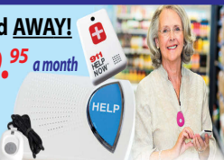
This Button SAVES Lives! As Shown GPS, Lowest Price Guaranteed!