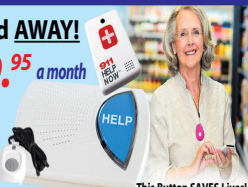
This Button SAVES Lives! As Shown GPS, Lowest Price Guaranteed!